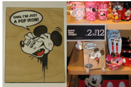
Fig. 3 A Mickey Mouse sign shopdropped in a Disney store ( http://www.instructables.com/id/How-To-Shop-Drop/ ; accessed 27/02/18).

and other examples inspired me to think about what I wanted my own shopdrop to be like. I was becoming so enthusiastic that I told my friends over coffee what I was thinking of doing. They, in turn, told me about hilarious shopdropping examples they had come across with which I, again, looked up online. This illustrates how the practice of shopdropping travels widely, online and offline, from internet user to internet user, friend to friend, activist to activist.