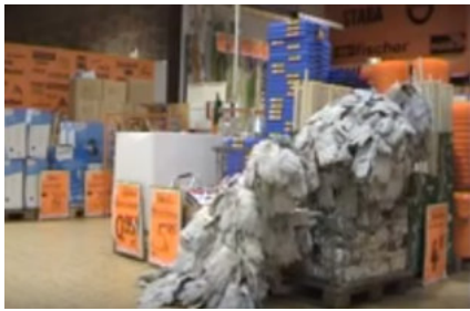
Fig. 1 How to shopdrop yourself looking like a pile of work gloves ( https://www.youtube.com/watch?v=bjLC6JviZtE ; accessed 27/02/18).

How to shopdrop in ten steps... Yes, that sounds helpful, I think. I've been sitting in front of the computer for quite a while, searching the internet for references on shopdropping. I wildly click through the websites until... Wait a minute, this is funny! Two people shopdropped themselves, wearing huge costumes made of work gloves. They pretend to be a pile of gloves in a hardware shop – oh my God, THIS IS HILARIOUS!!!