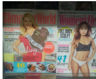
Fig. 2 Before and after – Shopdropping a feminist sloth sticker on a diet magazine in a supermarket.

I did it. I shopdropped a feminist sloth sticker (see Fig. 2). I am now officially among the group of „guerrilla counter-consumerists“ (SHIFT! 2012). And it feels good! It took me a couple of days to figure out where and how to do the drop. You cannot just shopdrop anything anywhere. It takes time to prepare. I needed to think about the product I wanted to target and the message I was hoping to get across. I was sitting at my desk at home, thinking hard, when my eyes caught the sloth sticker on my shelf. I had glued it there when I moved in. The sloth was a feminist one,