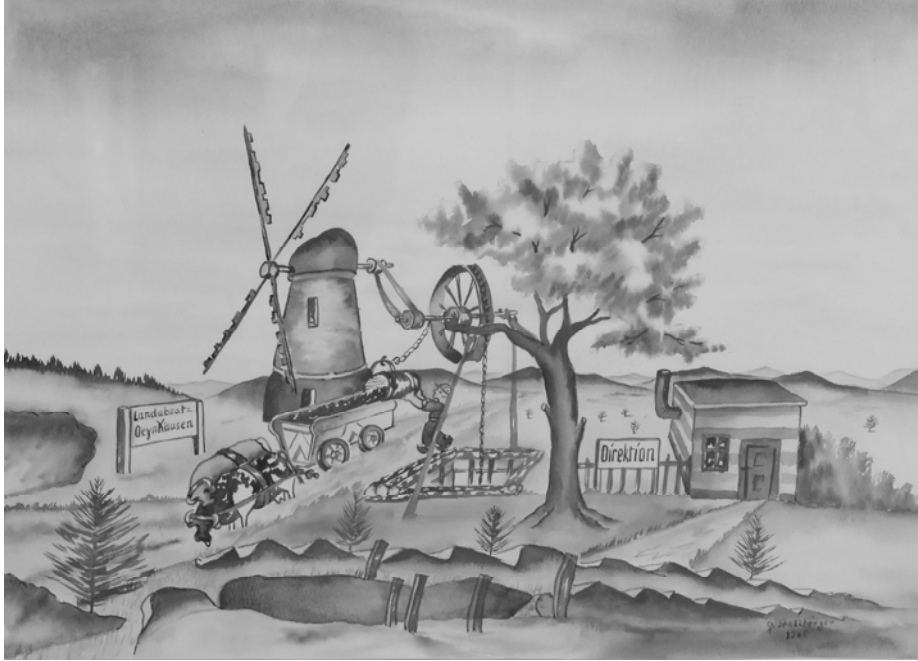
Fig. 2: “The von Oeynhausen shaft seen from the Ruhr”. Indian drawing by J. Stallbörger, Ibbenbüren, 1960.

the high pressure underground, the miners were forced to work on new concepts of tunnel construction. Thus, they developed the so-called Ibbenbüren system on the basis of the New Austrian Tunnelling Method. By contrast, the people in Ibbenbüren would hardly dispute the relatively strong rural features in which the mine is embedded. And here lies another truth behind their own description of being a Gallic village.