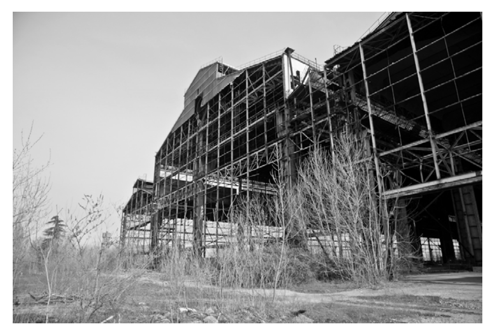
Figure 2: Falck Concordia plant viewed from the outside