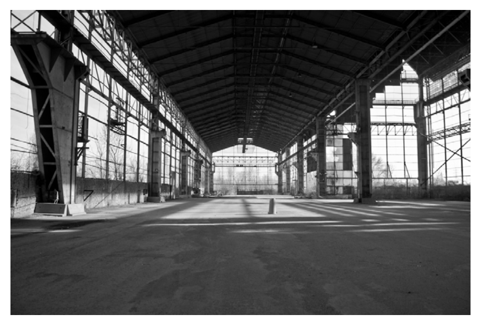
Figure 3: Concordia is currently the only former Falck plant accessible with prior authorisation

estate services. In turn, Prelios Group is a key partner for Intesa Sanpaolo, the first Italian banking group for capitalisation, and Hines, one of the world's leading developers.