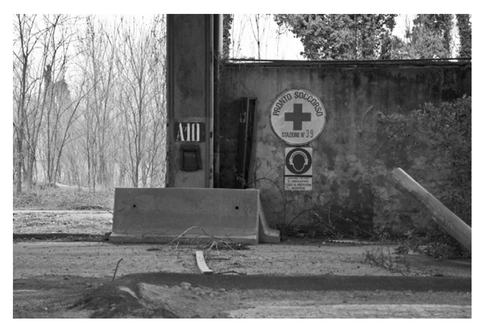
Figure 8: Rusty production signs, still imparting instructions and orders

Gillio's photos signify places and locales that have an arduous and buzzing history of men and women but which are now empty, silent, and desolate, a landscape in transition that is, itself, set to disappear (Apel 2015). The pictures' assumed emptiness, however, points to another product of change that literally grows from the industrial ruins and demands interpretation: a new kind of industrial nature, a new public art, unprecedented ruins of modernity.