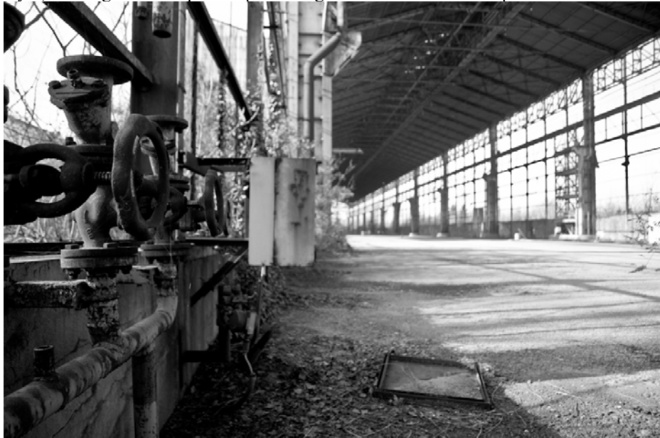
Figure 4: Falck Concordia inside view

layer, a strong visual trope of representing the deindustrialisation process.