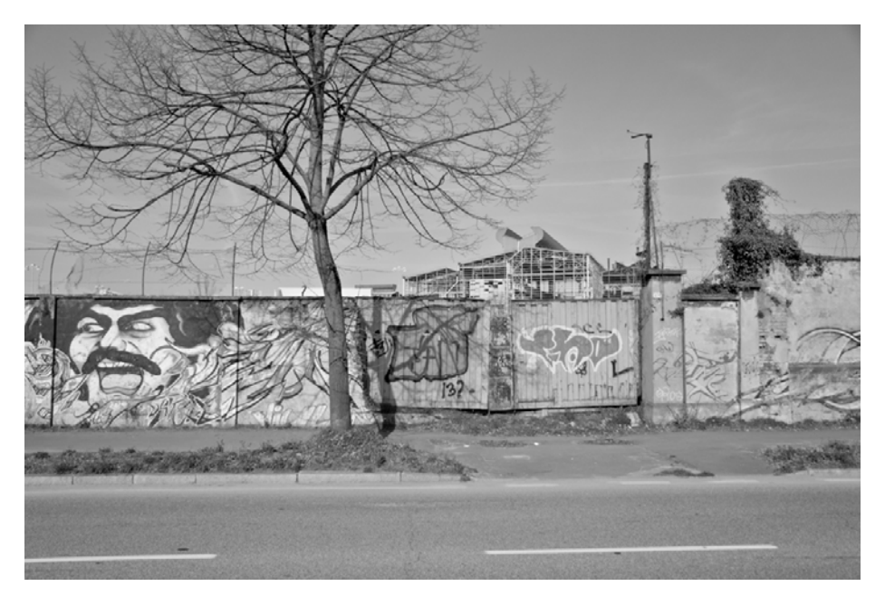
Figure 11: Street art on Viale Italia. The Unione plant in the background, with its pincer-shaped roof, rebuilt in the 1950s and still visible, is a Falck landmark