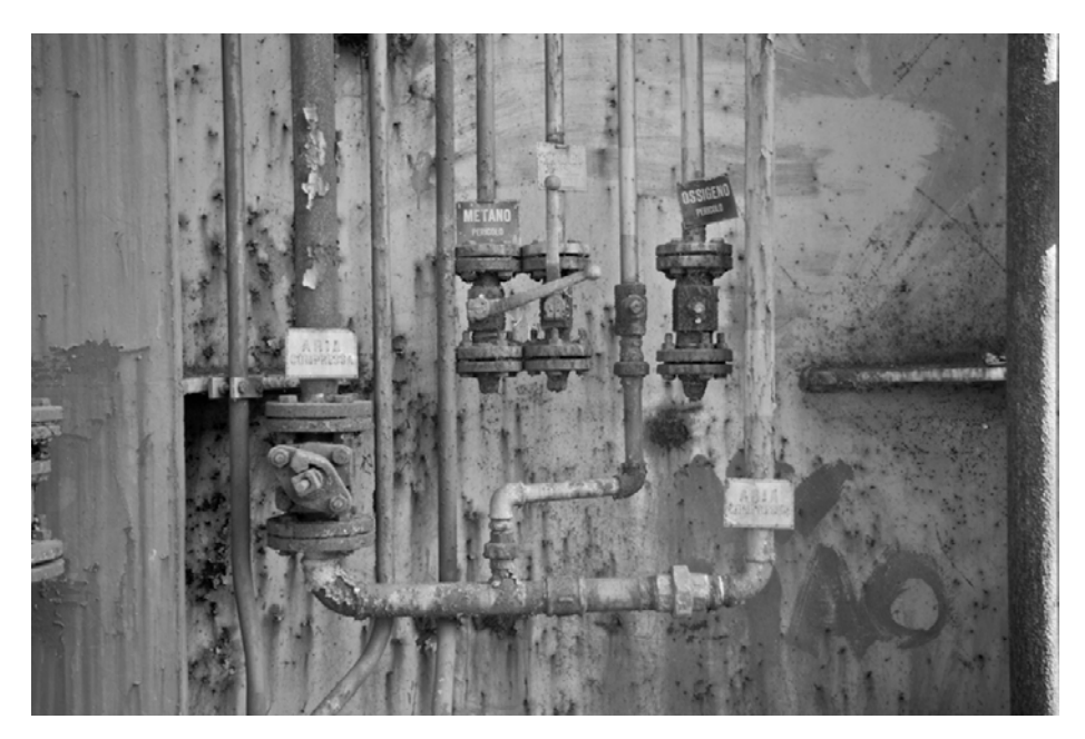
Figure 7: Compressed air and methane gas system

Just as abandonment and derelict spaces have become a powerful cultural motif in western societies, the photographic representation of deindustrial space has become a new photographic genre at an almost global level. As such it ends up saying less about the specific places depicted and more about the effects of globalisation (High/Lewis 2007; High 2013a; Strangleman 2013). The photographic practice in Sesto, which has produced impressive pictures in recent years, has to be seen in this context – from well-known photographers (Gianni Berengo Gardin 1996, see Gabriele Basilico's work in Corrias 2011) to talented amateurs (Aurelio Spinelli 2009) to ordinary people who practice photography as a hobby. Since the Falck area – invisible and inaccessible for more than twenty years after the shutdown – has become a destination for controlled urban explorations in the form of guided tours, photo safaris, and photo contests proposed by the municipality, this kind of practice has generated a huge production of images that are distributed on websites, social networks, and in self-produced digital books.