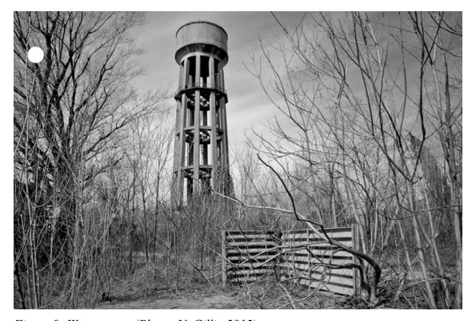
Figure 9: Water tower

turbance dynamics" connected with weeds "are important to study because these dynamics rework land across the globe". As "ruderal plants", weeds are "adapted to settle or survive in disturbed places and drastically transformed spaces", ultimately representing the most "recurring markers of and participants in times and places of change" (Falck 2010: 6 f.). They document both change and persistence on different chronological levels; they occupy landscapes associated with decay, multiply in times of transformation, but have coexisted with cities and urbanisation from times predating the onset of industry. Usually, this "fortuitous flora" is referred to in connection with its clash with economy and society as an indicator of decline, as though it appeared all of a sudden where it had never been before or where it had not grown for a long time. This perspective, however, conceals the persistence of weeds, their long coexistence with human landscapes, and ignores the fact that what has changed through time is mostly the way we deal with this kind of vegetation and the way city people experience the surrounding spaces undergoing transformation (Falck 2010). Mapping the way and chronology of the city's spontaneous vegetation – as Gillio's photographs do – reminds us how even such expressions of "industrial nature" (Storm 2014) are part and parcel of Sesto San Giovanni's history, which contribute to the understanding of its present landscape.