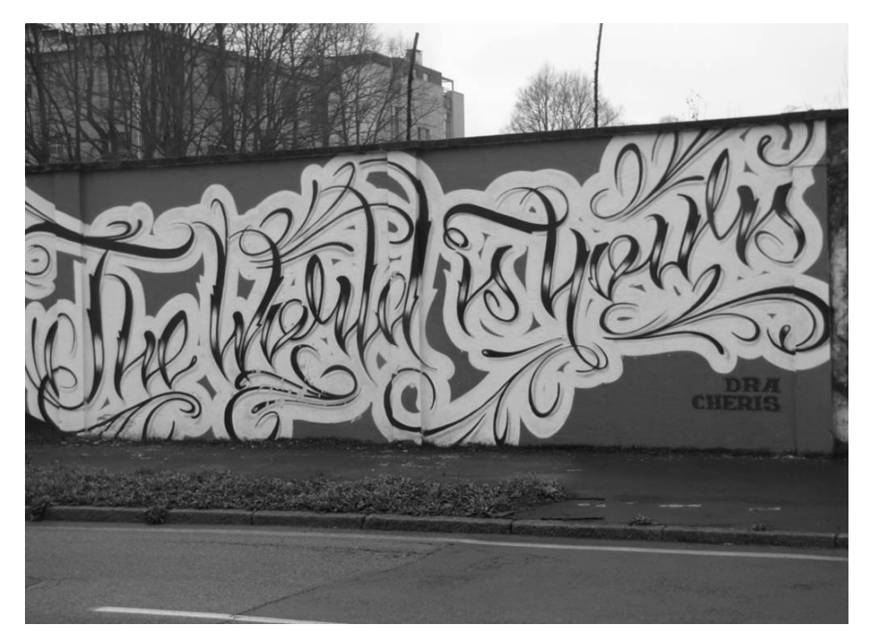
Figure 12: Graffiti on Viale Italia by a young female artist of Philippine origins, dedicated to a youth from Sesto who tragically died

While the "corporate wasteland" described by High and Lewis is object to the increasingly frequent practise of organised urban exploration, whose photographic and narrative knowledge the web and visual social media are helping to spread (High/Lewis 2007), the reproduction and circulation of ruin imagery – abandoned factories, derelict hotels, libraries, schools, churches, business buildings, etc. – has recently trickled through to the most diverse media, from fiction to graphic novels, music videos and video games, film, TV series, documentaries, advertising, art exhibitions, and coffeetable books (Linkon 2018). Deindustrialised imagery, in particular, connects with a dystopian element which, not by chance, has been noticed and often exploited by photographers, admen, and video and film makers who have taken inspiration from the locales of deindustrialisation in their construction of post-apocalyptic landscapes – which leads us to the somewhat disturbing idea that we ourselves live in the future ruins of our present (Dillon 2011):