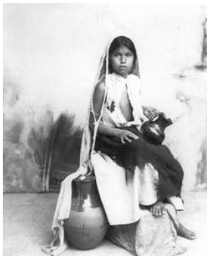
Girl posing with a pitcher

child psychology, together with the rise and spread of photography in the printed media, provided people with a previously nonexistent imaginary related to the definition and representation of these issues.