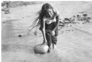
Girl collecting water in the lake, Winfield Scott, Chapala, Mexico, 1909, Private Collection