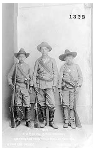
Child revolutionaries in northern Mexico, 1911

One of the potential threads for this cultural reflection on childhood consists in the use of images which change and recycle the meanings of childhood, providing different contexts for their reading. Examples of these singular transformations can be found in cartes de visite , the nota roja (sensationalist press) and crime tabloids, in studio portraits with the clinical view of physicians and educators, or in the blend of the civic with the religious in the photograph of a first communion labelled as an example of patriotism. All these are singular cases, but not exceptions; rather they illustrate a repeated tendency which needs to be taken into account in reading and interpretation of representations of this type.