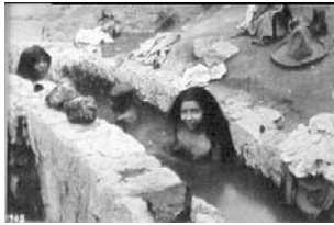
Poor girls taking a bath, Charles B. Waite, Mexico City, 1901, Private Collection