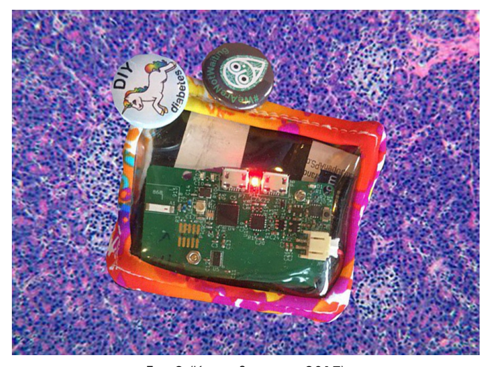
Fig. 2 (Karisa Senavitis, 2017)

OpenAPS was started in 2015 and continues to iterate and grow. Products that can be hacked by patients are seen as a manufacturer's liability (Weiss 2016). But as long as everybody in OpenAPS makes their own pancreas, by only sharing free information, the FDA has no jurisdiction (OpenHumans 2018). In Kosofsky Sedgwicks' sense of the reparative, the group is taking and reconfiguring the materials from the dominant industry to offer more sustenance to their community. The artificial pancreas's multiple, ambiguous presentations and constructions, through an unstable constellation of nodes, is non-normative even when it aspires to pass as the dominant cultural model. The OpenAPS pancreas is open to multiple ways of being and knowing a pancreas.